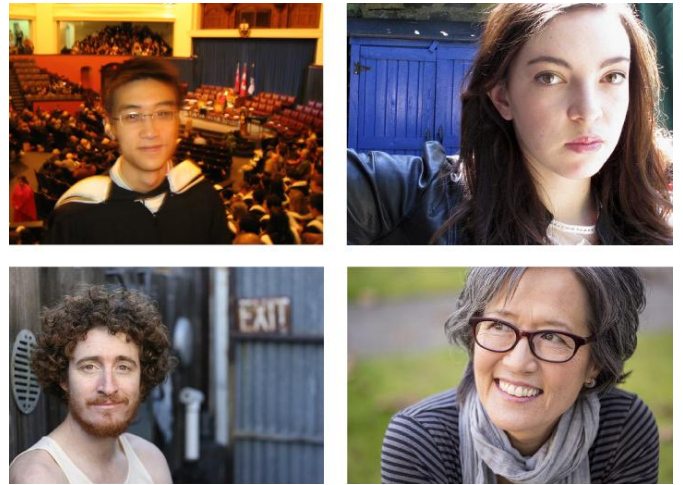
Figure 2. Example of bad headshots (top row) and good headshots (bottom row) from our database.

To the best of our knowledge, there is no publicly available database with human ratings focusing on this specific type of portraits. Therefore we collected a set of 380 photos with a single face, using both photos from private collections and photos uploaded on Flickr.com photo sharing website under the Attribution – NonCommercial License. Our set of photos contains a positive set of 258 RGB photos that were marked as aesthetically appealing and a negative set of 122 RGB photos marked as aesthetically unappealing (as illustrated in Figure 2). The photos in our database are at different resolutions and aspect ratios (min. 200 \times 200 , max. 1000 \times 667 ), acquired with both consumer and professional digital cameras. Classification of photos as being positive or negative was performed by a group of five people, including authors of this article. To test the classifiers on our photos, we separated photos in two subsets: the first one was the training set and the second one was the evaluation set. We chose to